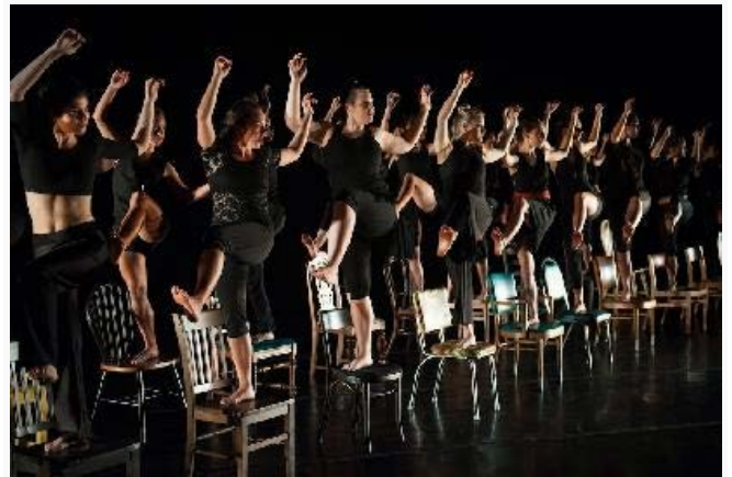
Work by Bliss Kohlmyer, USF Faculty