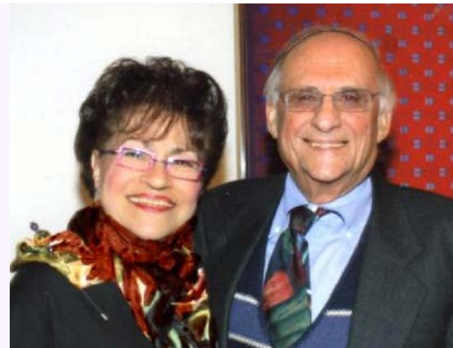
CHAMPION TO THE ARTS AWARD

Claifornia Institute of the Arts seeks Full-Time Faculty of Contemporary Dance Technique/Choreography, The Sharon Disney Lund School of Dance, Valencia, CA: California Institute of the Arts, The Sharon Disney Lund School of Dance, Valencia, California is searching for a Full-Time Faculty of Contemporary Dance Technique/Choreography. The candidate must have an established professional artistic background as a contemporary dancer and choreographer. FDEO/NDEO Members can login to the NDEO Job forum for a more detailed description of this position and contact information related to this position.